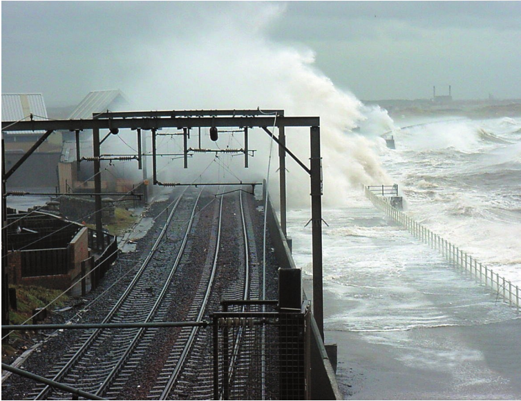
Ayrshire coast - Scotland